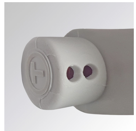
Oversized entry holes