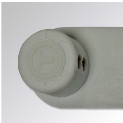
T logo engraved