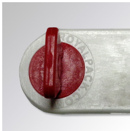
Manufacturer identification engraved